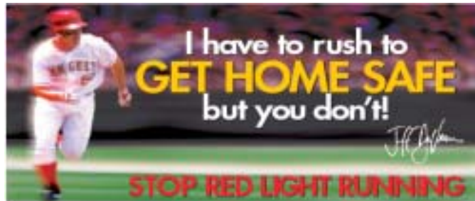
Anaheim Angels billboard featuring right fielder Jeff DaVanon

Tickets for the game are available online at www.TheOrioles.com or through the ticket office at (410) 685-9800.