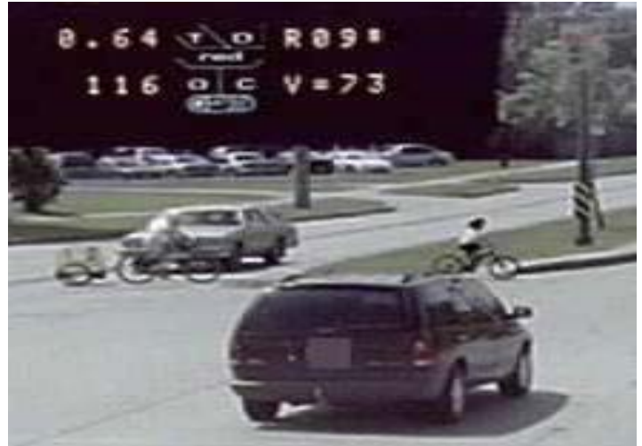
The image captured by the red light camera

The van's driver kept on going, apparently unaware he or she almost hit the child.